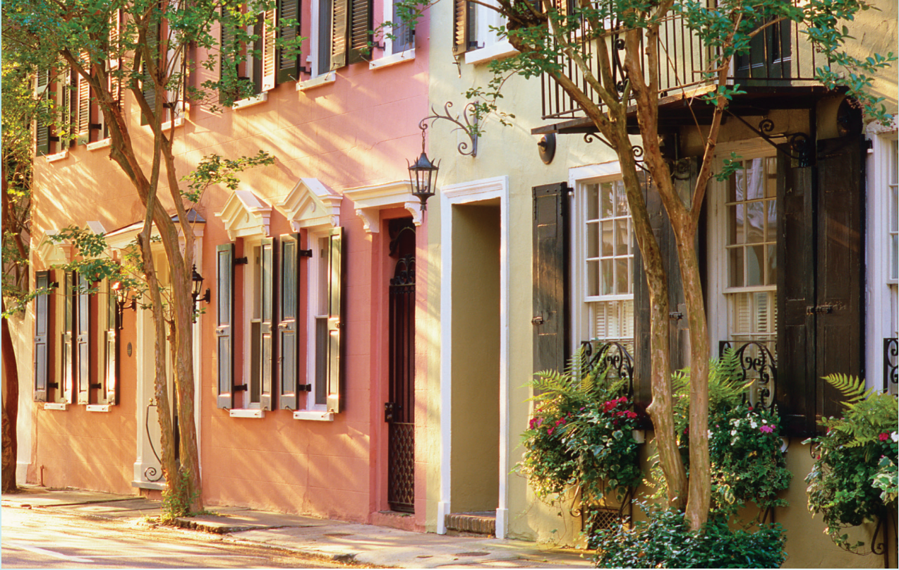
Tradd Street, Charleston, SC