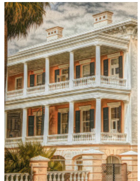
East Battery Home, Charleston, SC