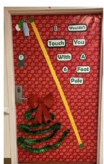
3rd Place: Research Office