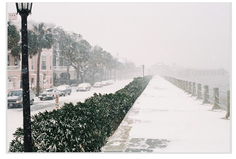
The Battery Christmas, 1989

In this edition of Sleepy Times, we have accumulated some of the many pictures that members of our department took both on campus and at home. As you look at them, I hope that you too fondly remember the gift .