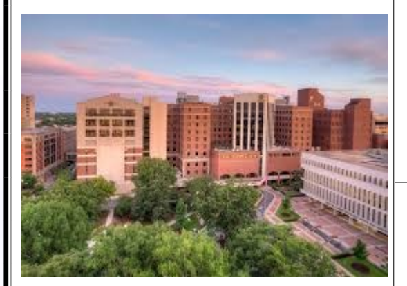
Follow us on Facebook, Instagram, and Twitter: