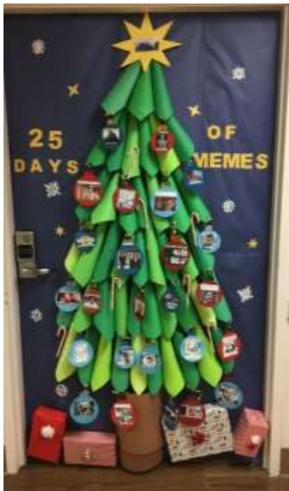
Research Office, 1st Place Winner

Here are the winners and participants of the 2018 Holiday Door Decorating Contest. Well done, everyone!