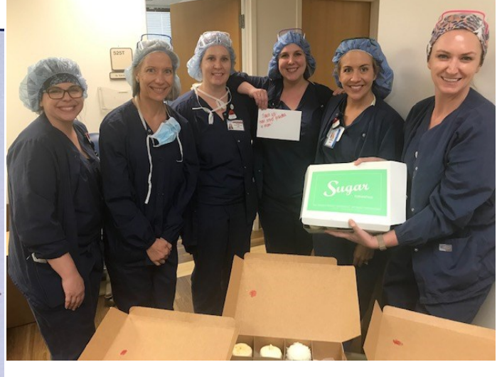
A Big Thank You!

THANK YOU SOVERY MUCH FOR TAKING THE TIME TO UNDERSTAND MY MEDICAL CONDITION AND SYMPTOMS, FOR THE FIRST TIME IN 5 YEARS I FEEL CONFIDENT THAT YOUR PLAN FOR MY TREATMENT WILL GIVE THE RESULTS THAT I'VE BEEN SEARCHING FOR, PLEASE KNOW THAT I AM VERY GRATEFULL,