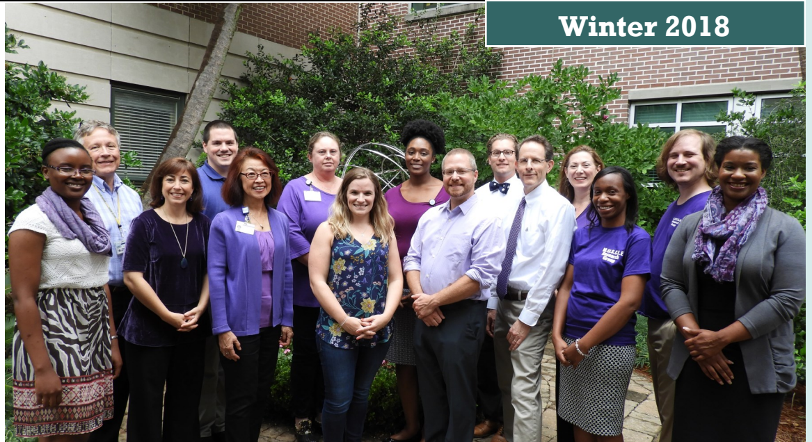
Medical University of South Carolina Lupus Erythematosus Research Group Division of Rheumatology and Immunology