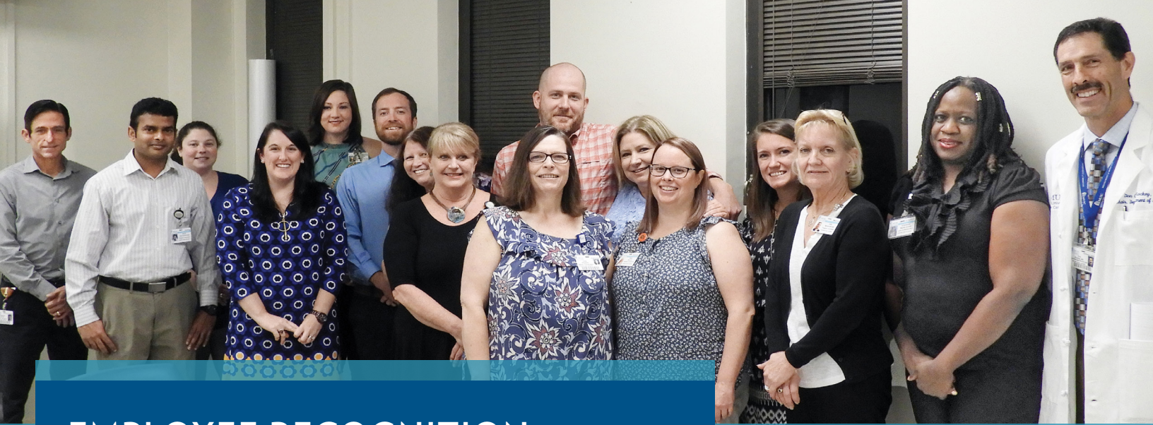
Employee of the Year ceremony