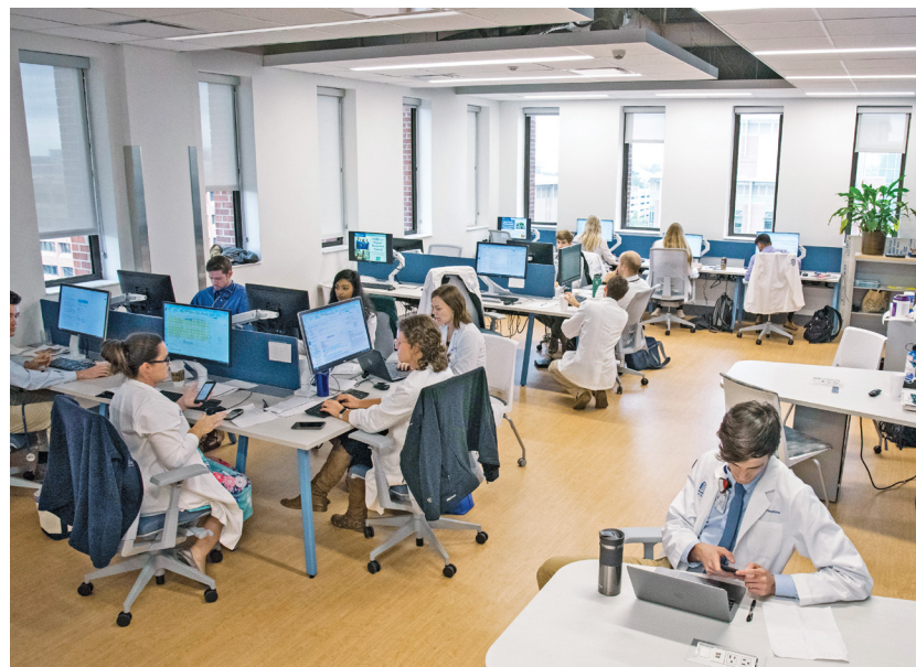
Newly renovated residency education space