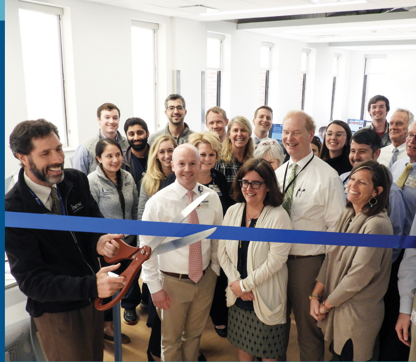
Residency education space ribbon cutting ceremony

The Department of Medicine is deeply committed to the education and training of skilled clinicians, researchers, and educators bound to become the health care leaders of tomorrow.