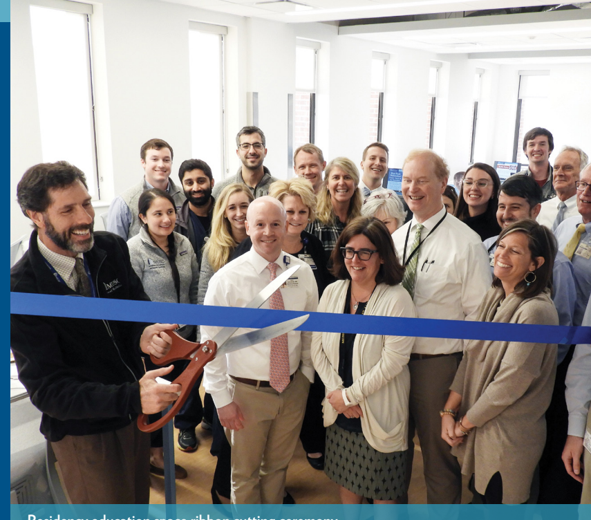
Residency education space ribbon cutting ceremony

The Department of Medicine is deeply committed to the education and training of skilled clinicians, researchers. and educators bound to become the health care leaders of tomorrow.