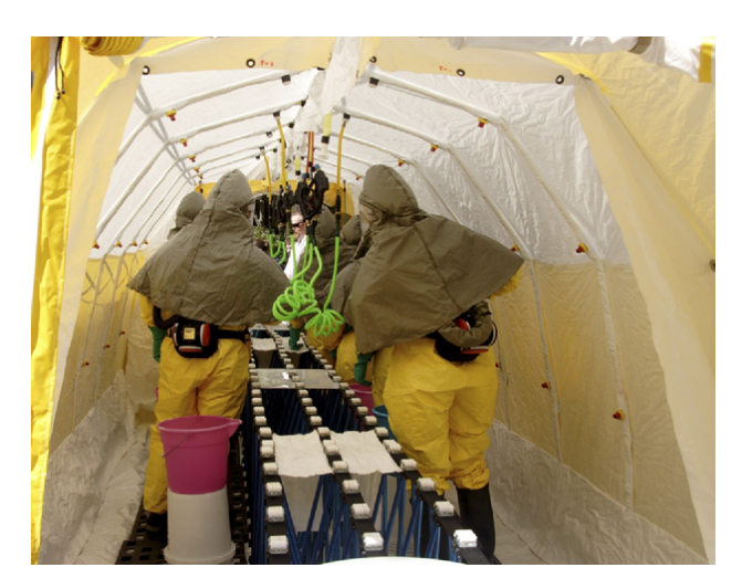
Figure 1. Students participating in the HAZMAT scene training scenario.

The fictional case and a brief overview of appropriate responses, both at the scene and at the receiving hospital, were presented by content experts in a traditional lecture format. The case involved an overturned truck on a rural, two-lane highway with a possible chemical exposure and multiple victims. After the 90-min lecture component, students went outside to be greeted by five tactical emergency medical services professionals who divided them into two groups: one group dressed in HAZMAT suits and participated in a simulated chemical spill victim decontamination (Figure 1), whereas the other group participated in the MCI drill that required them to rapidly triage 100 life-sized inflatable mannequins tagged with physical parameters indicating respiratory, circulatory, and mental status parameters (Figures 2, 3). After about 40 min, the student groups switched exercises.