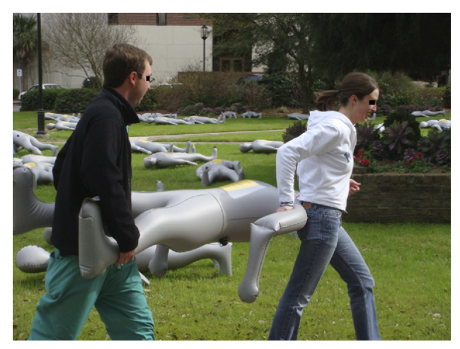
Figure 2. Students transporting an inflatable mannequin, tagged with vital signs and clinical information, to a triage station during the MCI training scenario.

The fictional case and a brief overview of appropriate responses, both at the scene and at the receiving hospital, were presented by content experts in a traditional lecture format. The case involved an overturned truck on a rural, two-lane highway with a possible chemical exposure and multiple victims. After the 90-min lecture component, students went outside to be greeted by five tactical emergency medical services professionals who divided them into two groups: one group dressed in HAZMAT suits and participated in a simulated chemical spill victim decontamination (Figure 1), whereas the other group participated in the MCI drill that required them to rapidly triage 100 life-sized inflatable mannequins tagged with physical parameters indicating respiratory, circulatory, and mental status parameters (Figures 2, 3). After about 40 min, the student groups switched exercises.