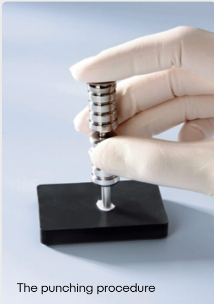
The punching procedure