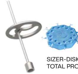
SIZER-DISK FOR TOTAL PROSTHESES

* With integrated BELL Expander for expanding the bell foot