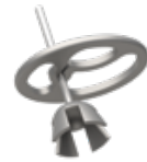
SIZER-DISK FOR PARTIAL PROSTHESES*