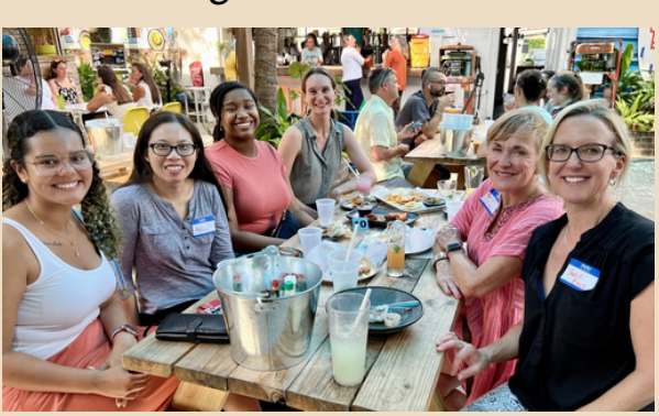
APPLY NOW: IN-PERSON SUMMER FELLOW APPLICATION

In-Person Summer Fellows are expected to participate full-time, attend weekly didactic seminars inperson, meet regularly with their research mentor, and present at the DART Summer Research Day.