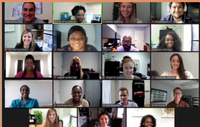
The Recharge Team meet on Zoom to discuss lab updates.