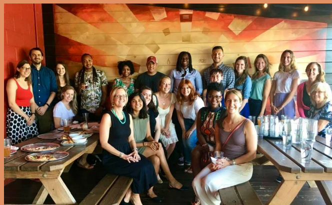
The Back -Flanagan Lab gather in person (outdoors) together.