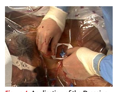
Figure 4. Application of the Dressing.