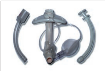
Figure 1. Components of the Tracheostomy Tube.

Next, use the scalpel to make a horizontal incision through the cricothyroid membrane. You may feel a pop as you enter the trachea. Extend the incision laterally, turn the blade, and extend it in the opposite direction.