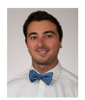
Medical School: Medical University of South Carolina College of Medicine