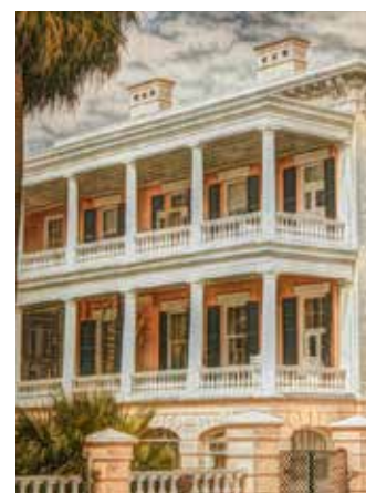
East Battery Home, Charleston, SC