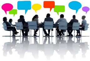
Mentor Leadership Council