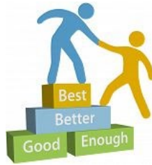
Department Mentoring Plans