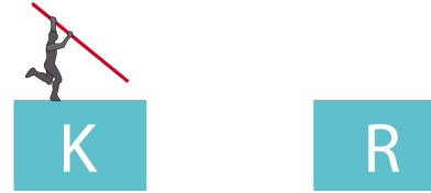
K to R Club